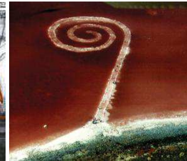
Robert Smithson's Spiral Jetty (1970)