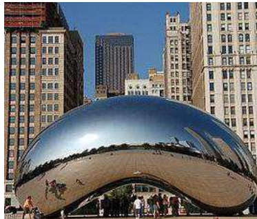
Anish Kappour's "Cloud Gate" (2006),