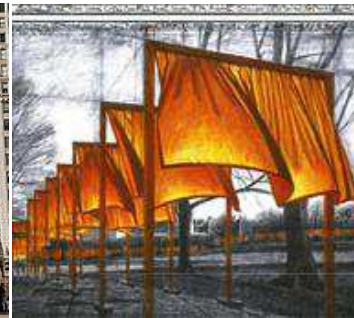
Christo and Jeanne-Claude's "Gates" (2005)